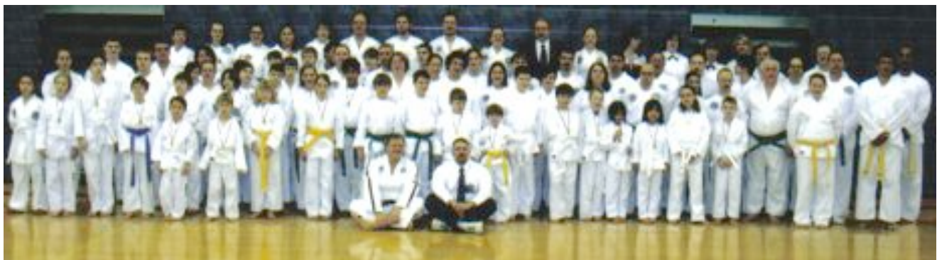
Participants and Officials from five Michigan schools competing and judging in Michigan’s Fourth Annual Tournament. Congratulations to all are in order!